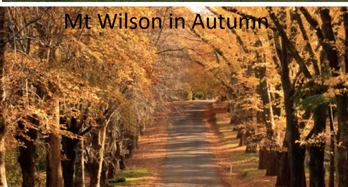
Mt Wilson in Autumn