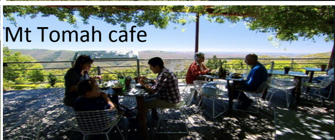
Mt Tomah cafe