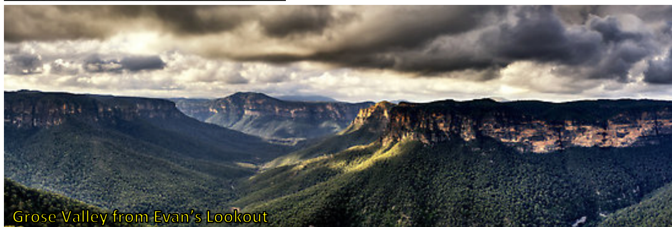
Grose Valley from Evan's Lookout