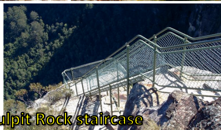
Pulpit Rock staircase