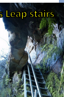
Govett's Leap stairs